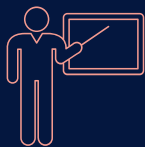
Academic & non-academic staff

Perception of institution's impact, the influence on curriculum development, and the influence on the institution's sustainability agenda.